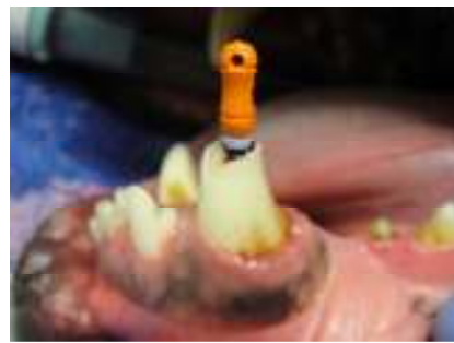
Fractured canine tooth with pulp exposed