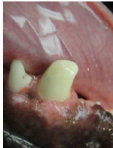
After root canal and composite restoration

There are many benefits to root canal therapy vs. extraction of a fractured tooth. When a root canal procedure is performed, the inside of the tooth (blood and nerve supply) is removed and filled with a material called gutta percha, thus eliminating infection and pain. In contrast, extraction is a surgical procedure thereby more traumatic and painful than having a root canal performed. The tooth structure also remains intact with a root canal, so the patient can continue to use the tooth for chewing. After a root canal, the opening into the tooth is sealed with a tooth colored composite (similar to bonding). Oftentimes, we will also prepare the tooth for a crown to further protect the tooth.